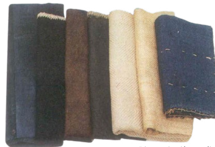
Fabrics produced from jute fibre.