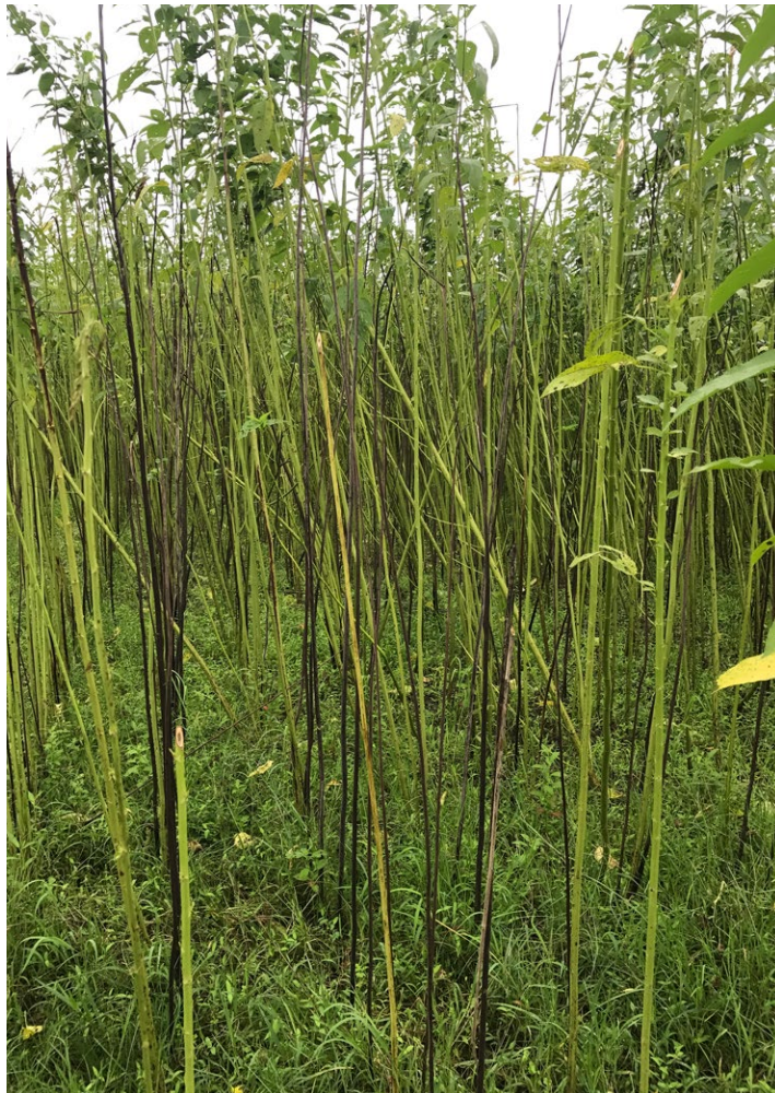
In recent years, farmers in Bangladesh have observed characteristic wilting of jute plants growing in the field.